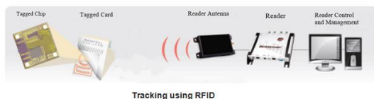
Figure 1 RFID Components

Reader: An RFID reader transmits an encoded radio signal to interrogate the tag. The RFID tag receives the message and then responds with its identification and other information. This may be only a unique tag serial number, or may be product-related information such as a stock number, lot or batch number, production date, or other specific information. Since tags have individual serial numbers, the RFID system design can discriminate among several tags that might be within the range of the RFID reader and read them simultaneously.